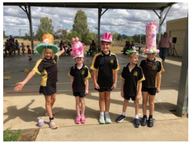
K-2 and 3-4 Easter hat creations