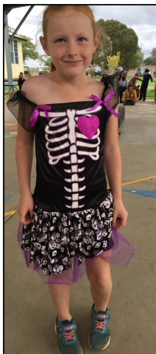
Khloe - Skeleton (Funny Bones)