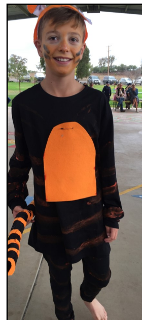
Chas - Tigger