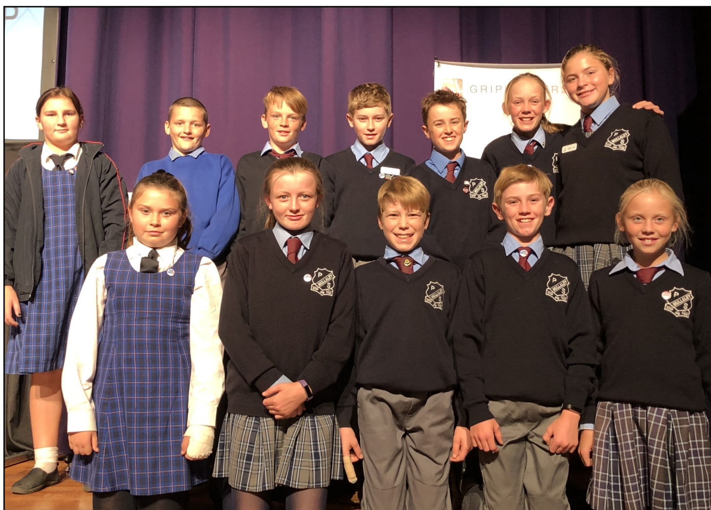
Mullaley and Carroll students at the Grip Leadership Conference in Tamworth yesterday